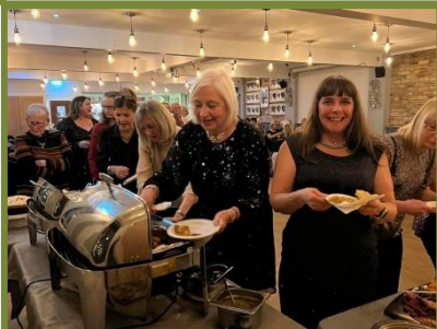
Fells Angels WI